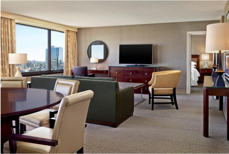
Parlour only – 500 sft